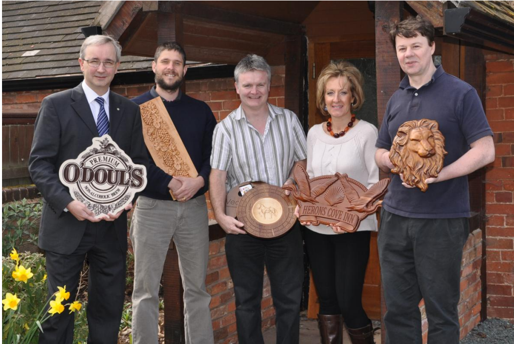
Caption: The Vetric Team